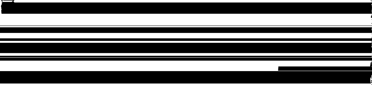
Table 10.13 shows the stage of development of the

although there may be a significant trend in the class